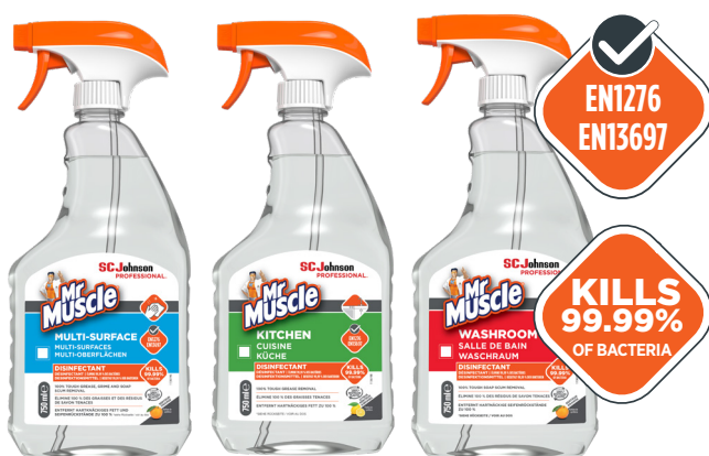
Mr Muscle® Multi Surface

Our Mr Muscle® range includes products for implementing targeted hygiene on all commonly touched surfaces in workplaces and public facilities. The products provide excellent physical cleaning and have the disinfection power to kill 99.99% of bacteria and specific viruses, including SARS-CoV-2. 5