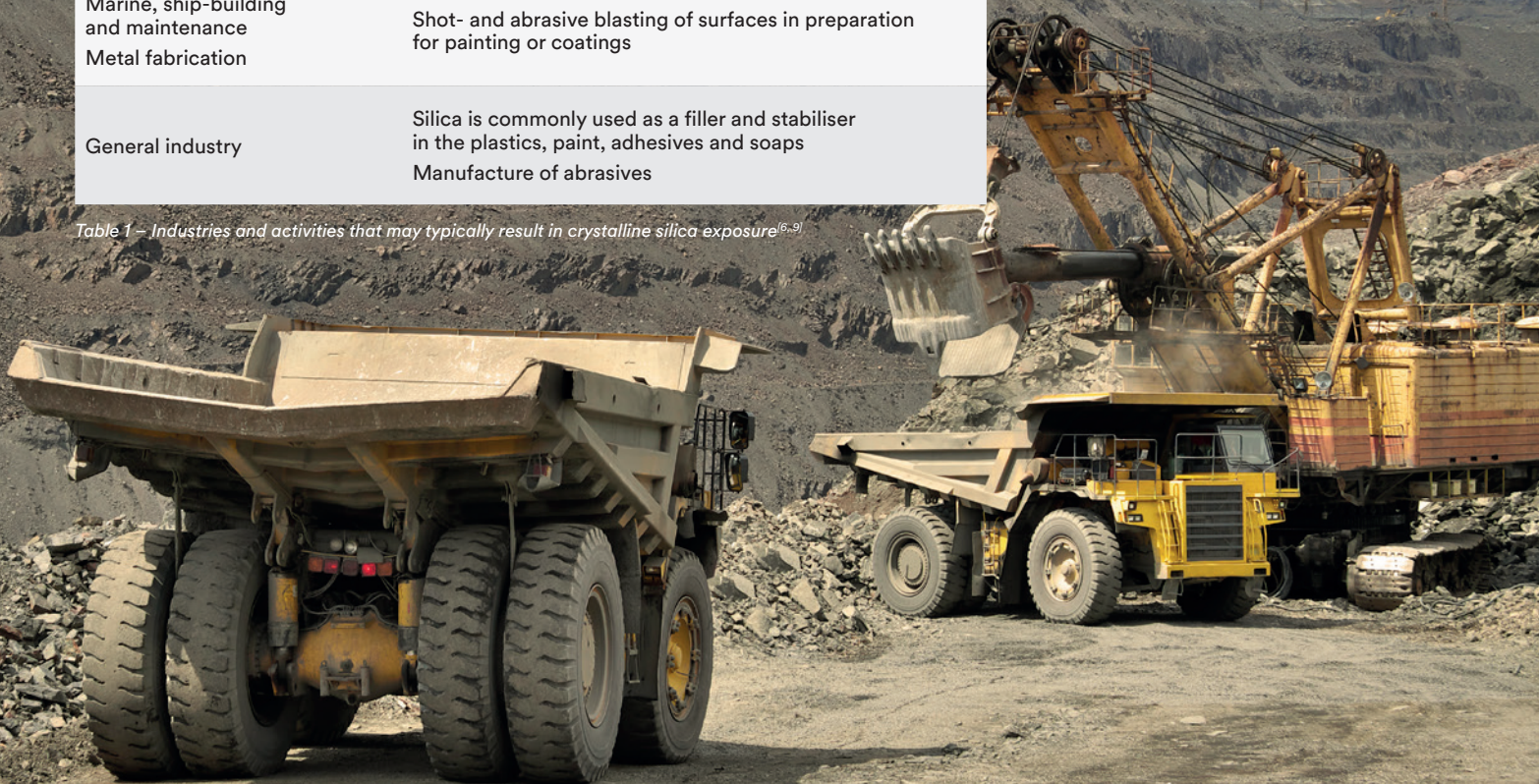
Table 1 – Industries and activities that may typically result in crystalline silica exposure [6,9]